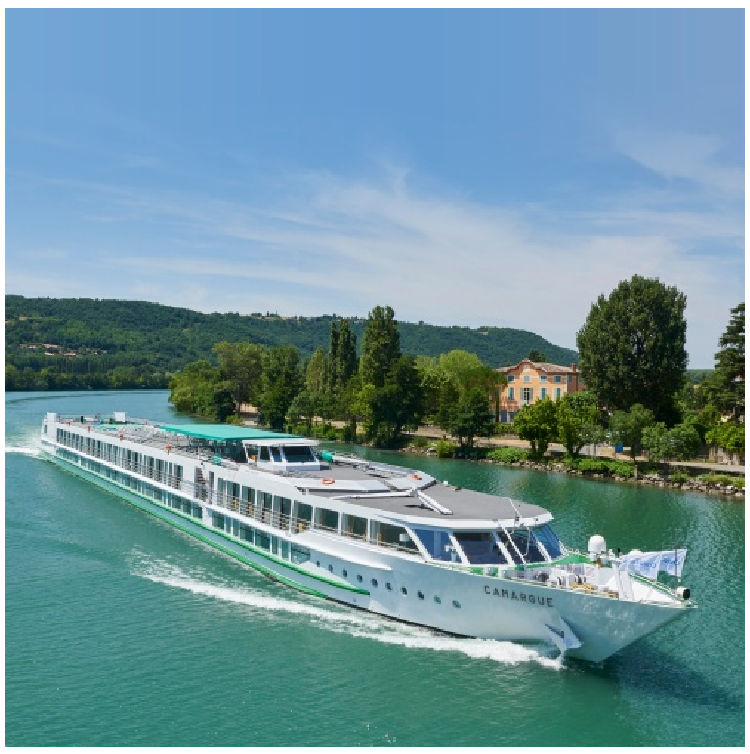
5 anchors - Rhone and Saone Rivers - 54 cabins